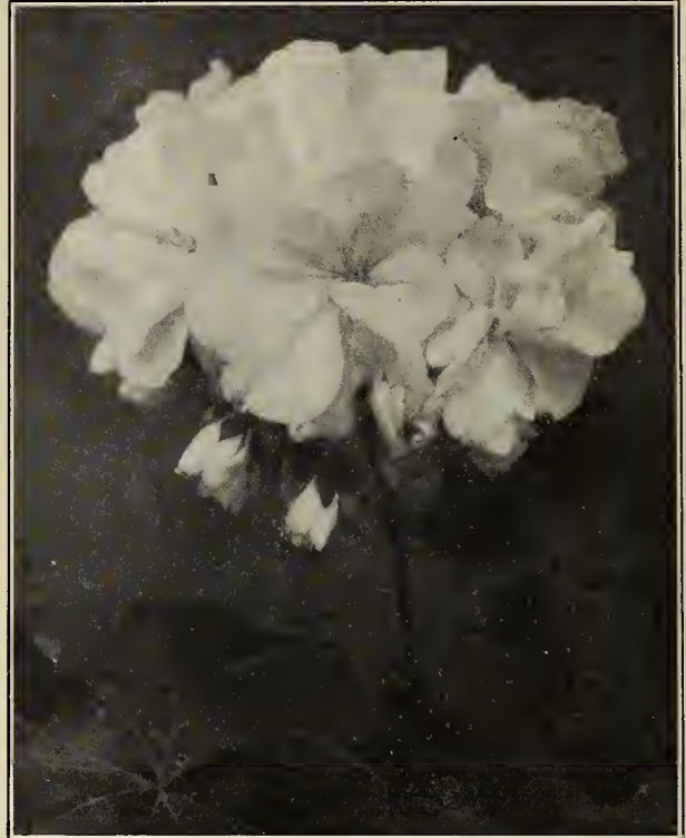
Edmond Blanc—See page 14